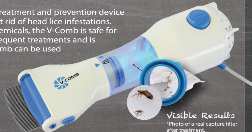
Visible Results *Photo of a real capture filter after treatment.

For more information about head lice and how to treat it, visit www.licetec.com.au