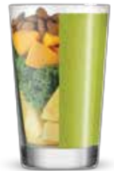
One minute green smoothies.