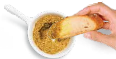
Variable speeds for milling, spice grinding, nut butters and milks.