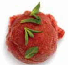
One minute frozen desserts.