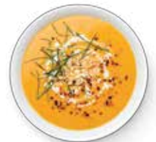
Cold to hot soup in 6 minutes.